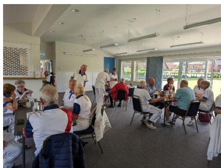
After the game