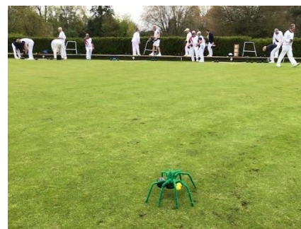
On the green