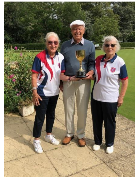
2023 Ladies 2 woods Pairs winners