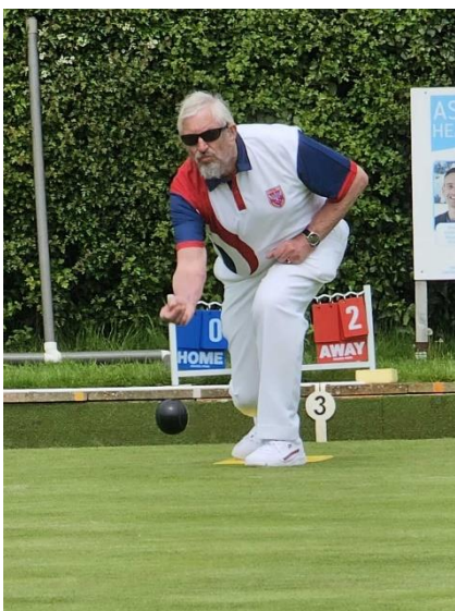
On the green

Thanks and well done to everyone involved in another enjoyable afternoon of bowls.