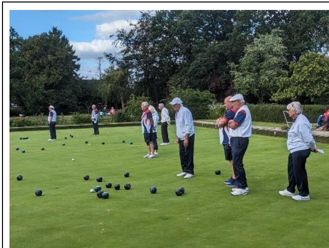
On the Green