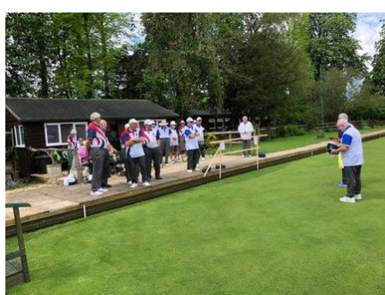
Announcing the game

Thanks and well done to everyone involved in another enjoyable afternoon of bowls.