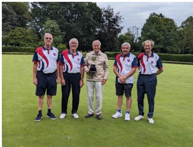
Nominated Pairs finalists