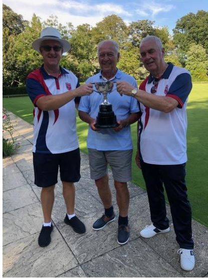
2023 Mens Pairs winners