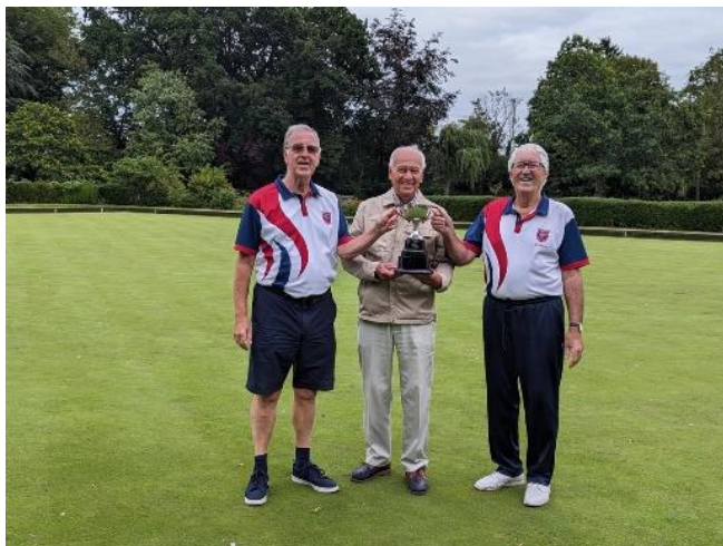
Nominated Pairs winners

Thanks and well done to everyone involved in another enjoyable afternoon of bowls