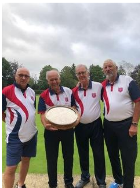
Mens Triples winners