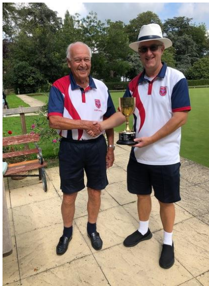
2023 Open 2 woods Singles winner