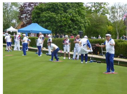
On the green