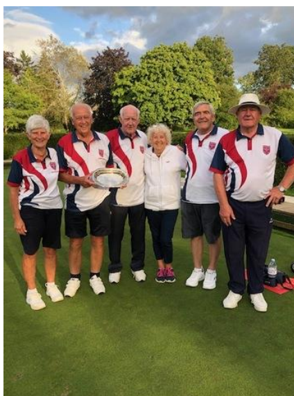
OFFA trophy finalists