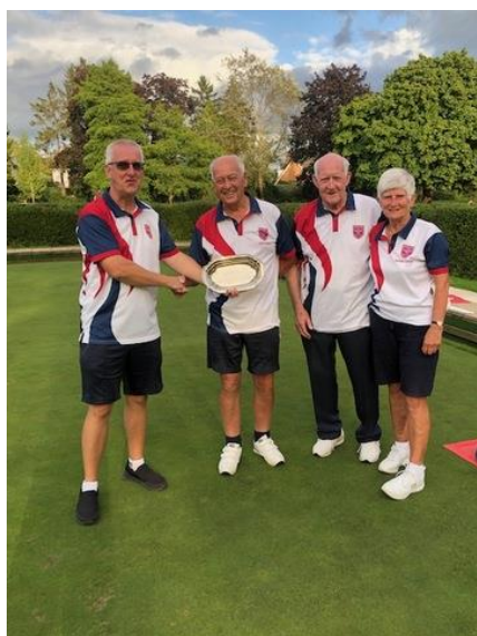
OFFA trophy winners

Thanks and well done to everyone involved in another enjoyable afternoon of bowls.