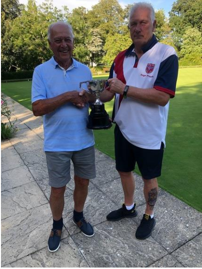
2023 Novice Singles winner