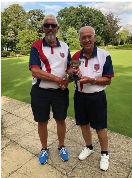
2023 Mens Singles winner