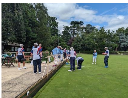
On the Green