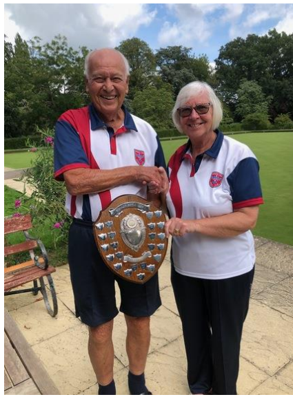
2023 Ladies Singles winner