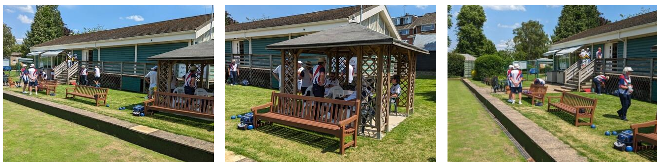
On the Green

Thanks and well done to everyone involved in another enjoyable afternoon of bowls