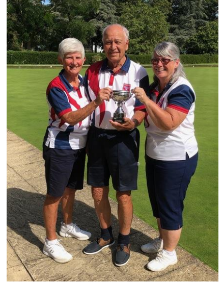
2023 Ladies Pairs winners