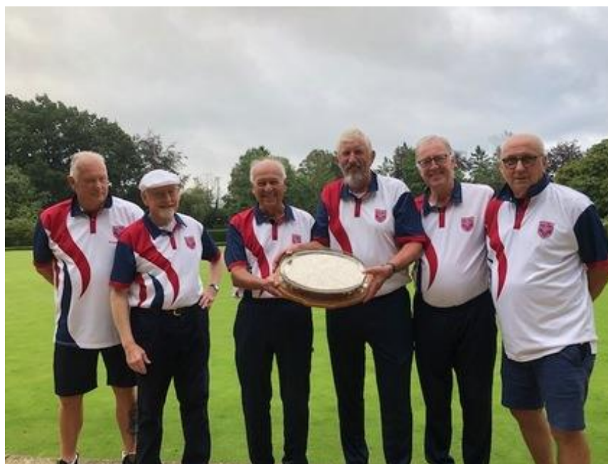
Mens Triples finalists