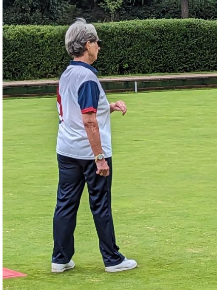
On the Green